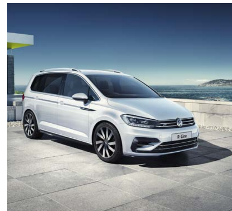
Model shown is Touran R-Line with optional LED premium headlights.