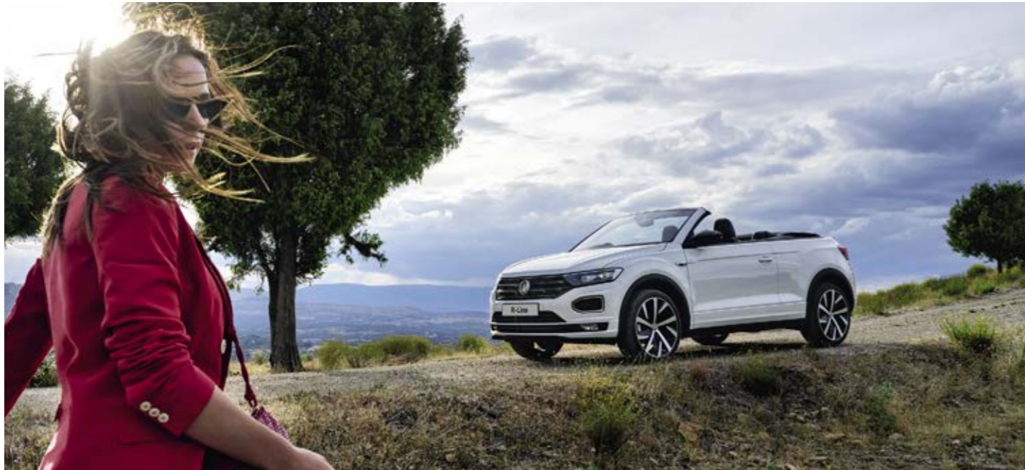
Model shown (above) is T-Roc Cabriolet R-Line with optional 19" 'San Marino' alloy wheels and non-metallic paint. Model shown (right) is new Arteon Shooting Brake R-Line with optional 20" 'Nashville' alloy wheels, Dynamic Chassis Control (DCC), 'IQ. Light' LED headlights, Park Assist and metallic paint.