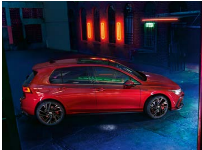
Model shown is new Golf GTI with optional 19" 'Adelaide' Black diamond-turned alloy wheels. 'Vienna' leather upholstery, panoramic sunroof and metallic paint.

The total amount you have agreed to pay us for this insurance policy. If you have not paid your premium , we will not provide cover from the date the premium was due. If the monthly payment option has been chosen and any instalment is not paid, your policy will end 30 days after the date the missed instalment was due.