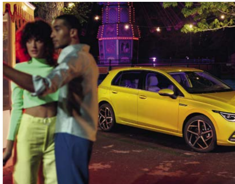
Model shown is new Golf Style with optional 18" 'Dallas' alloy wheels and 'IQ. Light' LED matrix headlights.