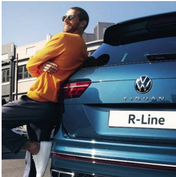
Model shown is new Tiguan R-Line with optional 'IQ. Light' LED headlights and metallic paint.

Whenever the following words or expressions appear in your policy, they have the meaning given below. For ease of reference, defined words or expressions in your policy are shown in bold type.