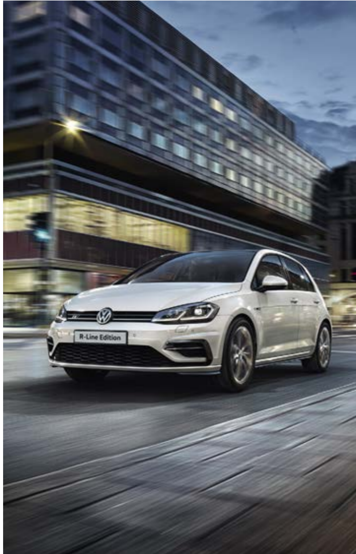
Model shown is Golf R-Line Edition with optional 18" 'Sebring' alloy wheels, panoramic sunroof and Oryx White premium signature paint.