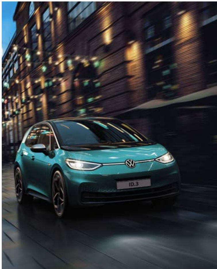
Model shown is ID.3 1 st Edition

Please also take a couple of minutes to check the details we hold for you on your schedule and tell us immediately if there are any mistakes.