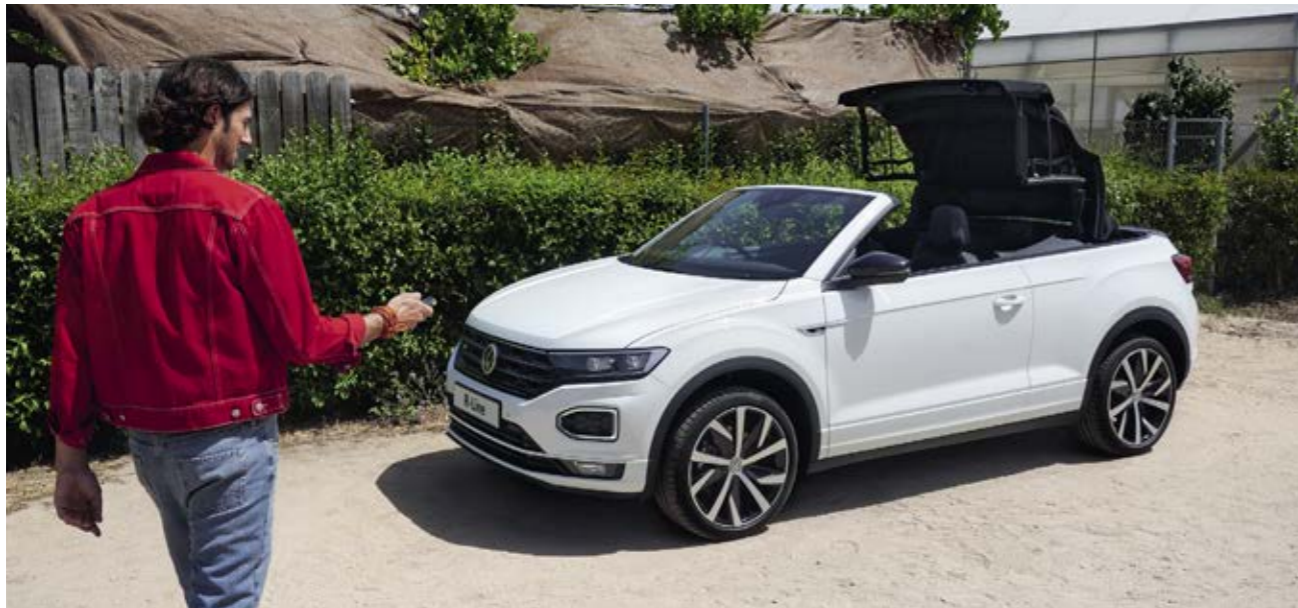
Model shown is T-Roc Cabriolet R-Line with optional 19" 'San Marino' alloy wheels and non-metallic paint.

For further information, you can visit The Motor Ombudsman website at www.TheMotorOmbudsman.org or call their Information Line on 0345 241 3008.