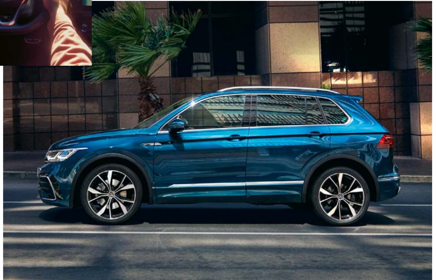
Front cover model shown is new Arteon Shooting Brake R-Line with optional 20" 'Nashville' alloy wheels, Dynamic Chassis Control (DCC), 'IQ. Light' LED headlights, Park Assist and metallic paint. Model shown on this page is new Tiguan R-Line with optional 'IQ. Light' LED headlights and metallic paint.